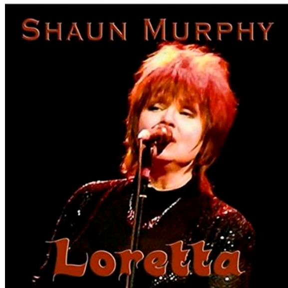
Vision Wall Records